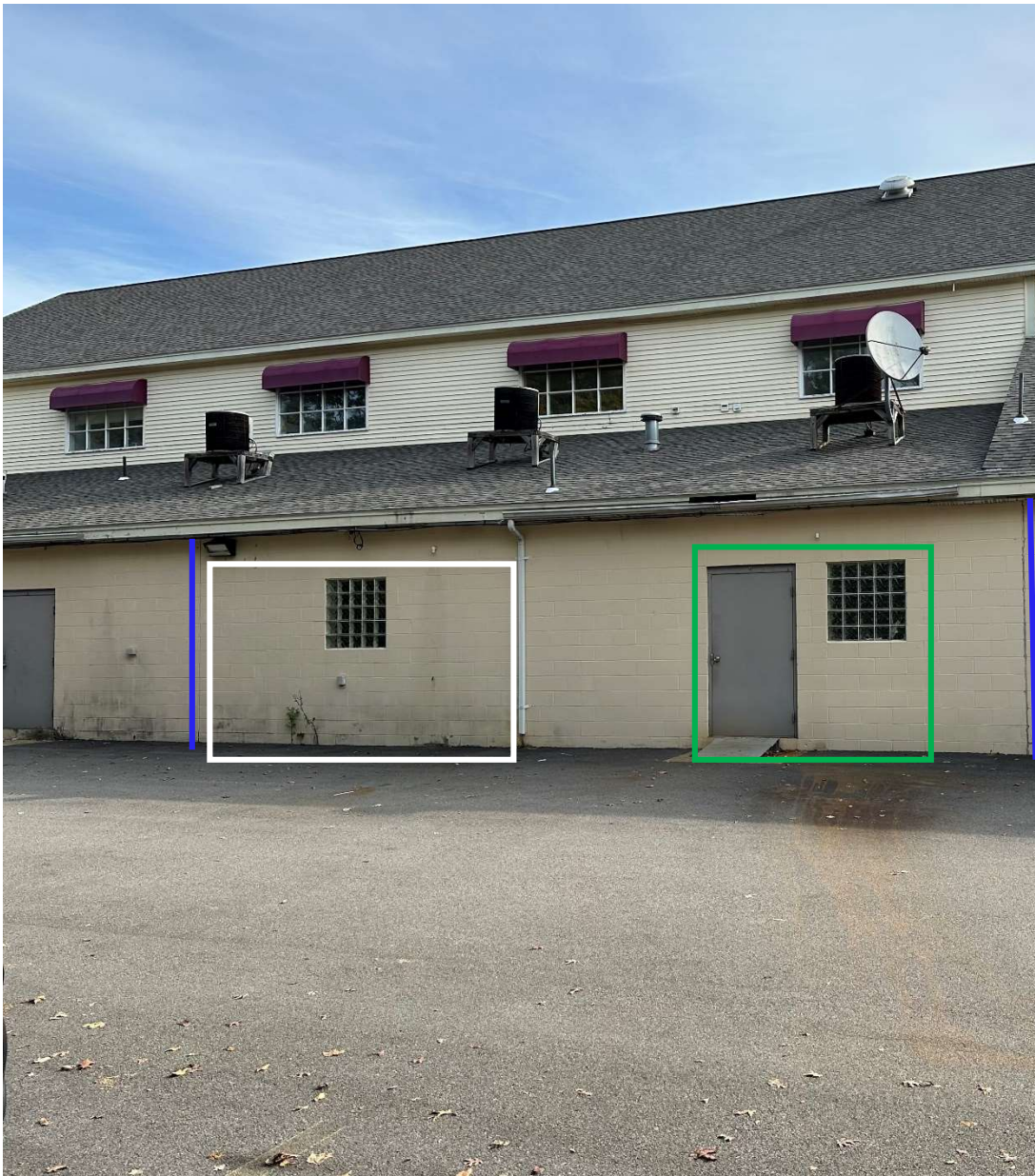
Photo of the Rear of Unit 3